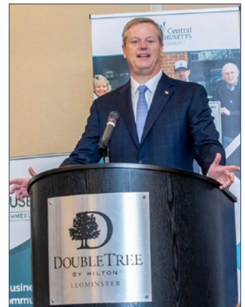
Governor Charlie Baker speaks before a packed room of business and community leaders at the November Good Morning North Central Breakfast.