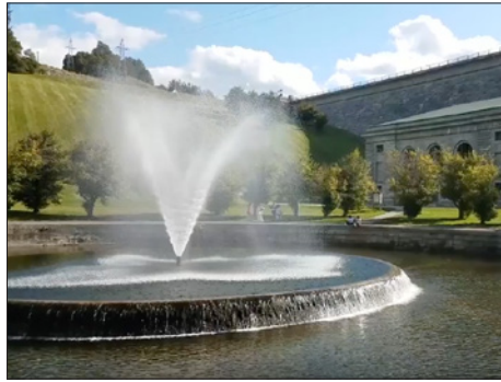
Screenshot from the new Economic Development video.

This short video includes strong visual content showcasing the dynamic and diverse nature of the region. It highlights the advantages of living and working in North Central Massachusetts, including quality of place, affordability, education, workforce and the region's convenient proximity to Boston, Worcester and other population centers. The video also spotlights the region's strengths in manufacturing, small business and its scenic beauty. Only two minutes and thirty-five seconds