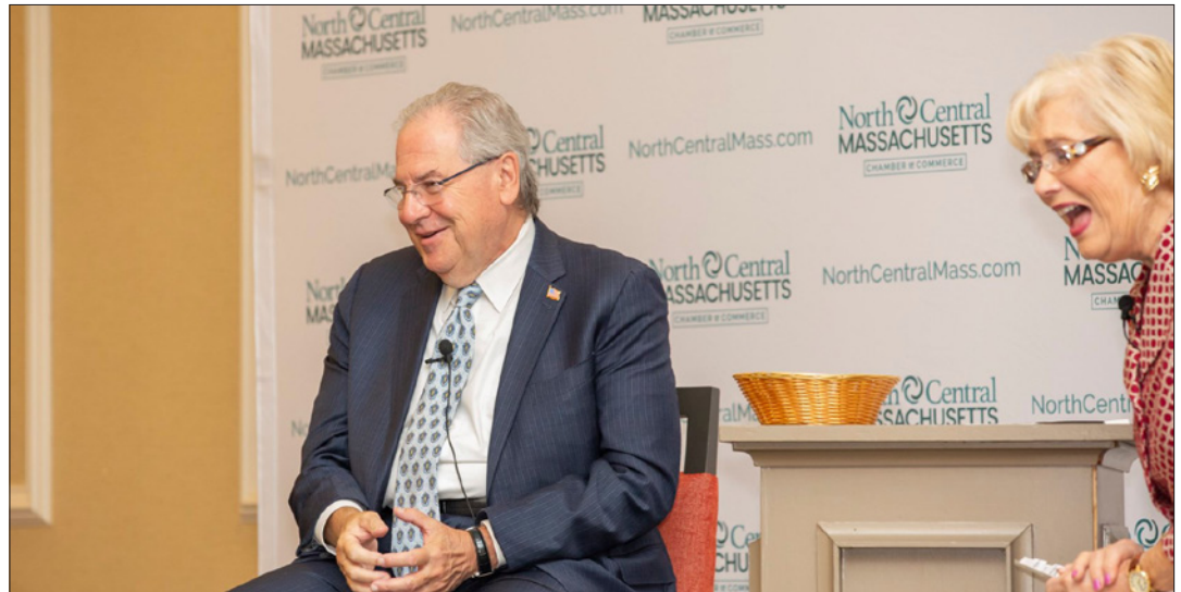
Speaker of the House, Rep. Robert DeLeo, speaks before the Good Morning North Central Breakfast crowd in September.

"The North Central Massachusetts business community is actively engaged in important, pro-business policy issues," said