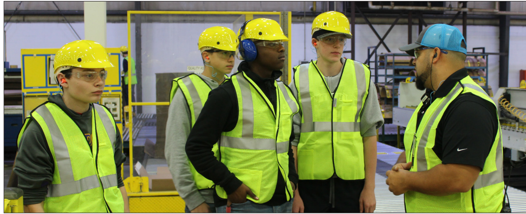
Pictured here are students from Monty Tech High School touring Nypromold in Clinton.