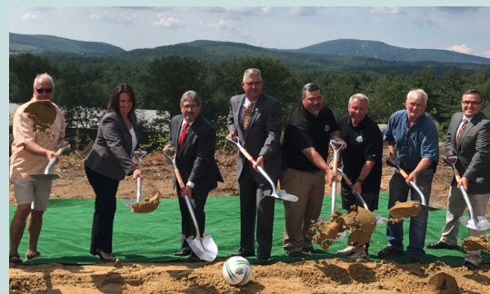
Ground-breaking for Game On site in West Fitchburg

We are looking to businesses and individuals to help support this effort with contributions to the Economic Advancement Fund. We have set a goal of $350,000 over the next three years to help supplement the expansion of our economic development efforts. Please consider making a special contribution to this effort. This is a great way to make an impact and empower our communities to compete and win in the economic development game! To learn more or to invest in our Economic Advancement Fund, please visit www.ChooseNorthCentral.com/advancement-fund or contact Roy Nascimento at 978.353.7600 ext. 225.