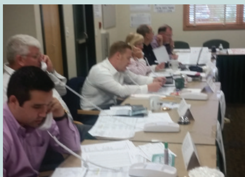
Chamber members were actively involved in the campaign, calling, texting and making new contacts with businesses throughout the region.

The North Central Massachusetts Chamber of Commerce held a successful 2015 New Member Campaign with the help of over 65 enthusiastic volunteers from local businesses.